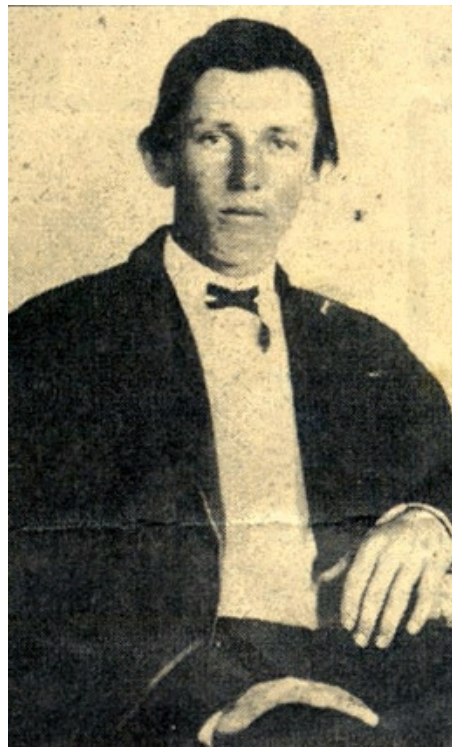
"Billy the Kid"

The missing honoree, whose State Dinner was on April 1, 1881, is William H. Bonney , better known as