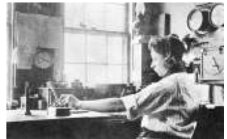
Wireless operator David Sarnoff

were picked up by the Carpathia , which rushed to the scene after receiving radio signals sent relentlessly from the doomed ship. In New York, 21-year-old David Sarnoff was at his post at a wireless station atop the Wanamaker department store and picked up some of those signals. Sarnoff reportedly spent 72 hours straight at his post, relaying messages to the press and anxious families. He went on to be a radio and television pioneer, as well as a member of The Lotos Club in 1923.