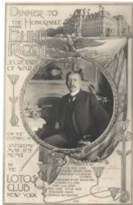
Elihu Root State Dinner menu, 1903

hands. Following President McKinley's assassination in 1901, Root stayed on as Roosevelt's Secretary of War.